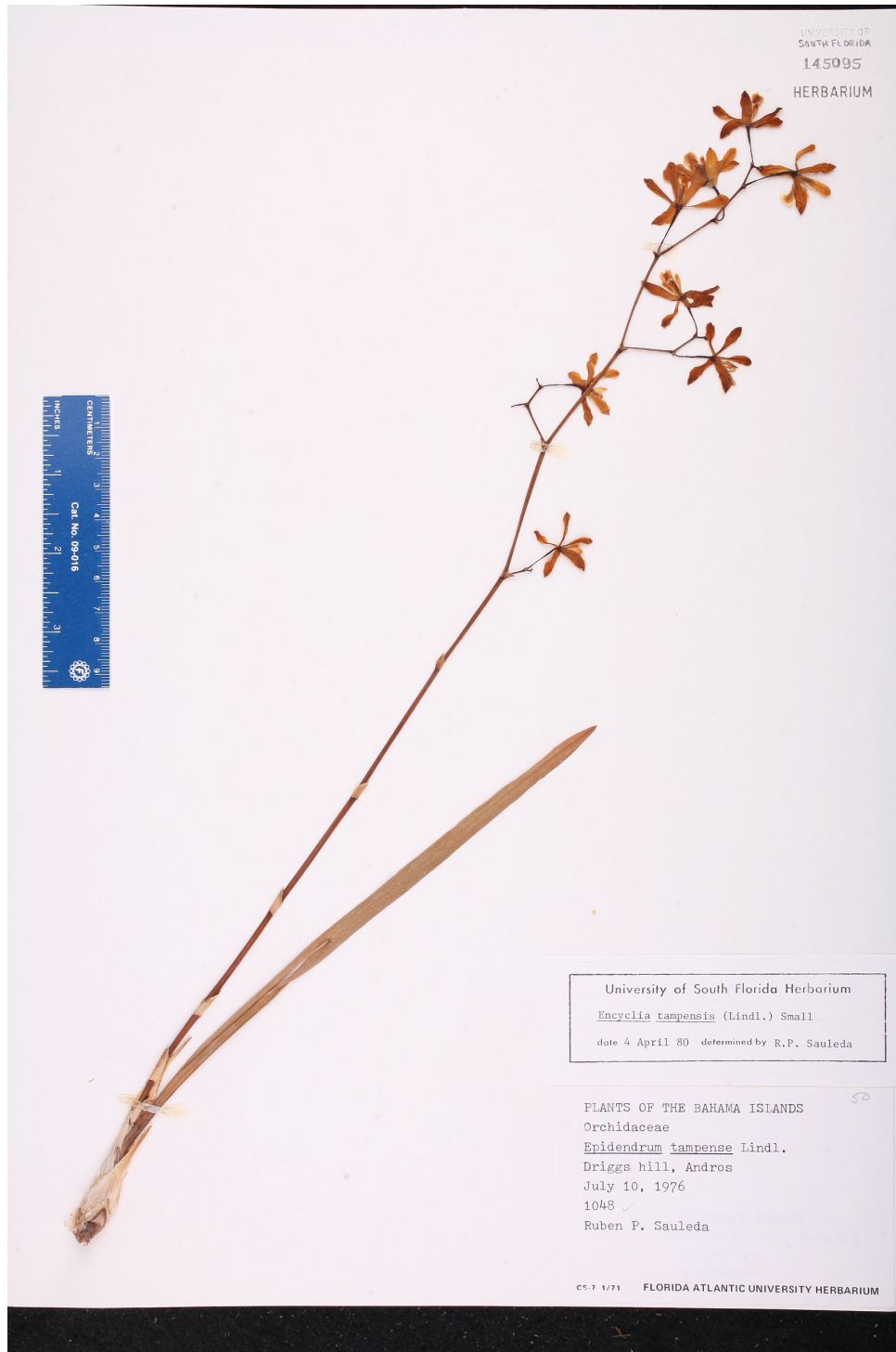
Encyclia androsiana Sauleda Holotype (USF)