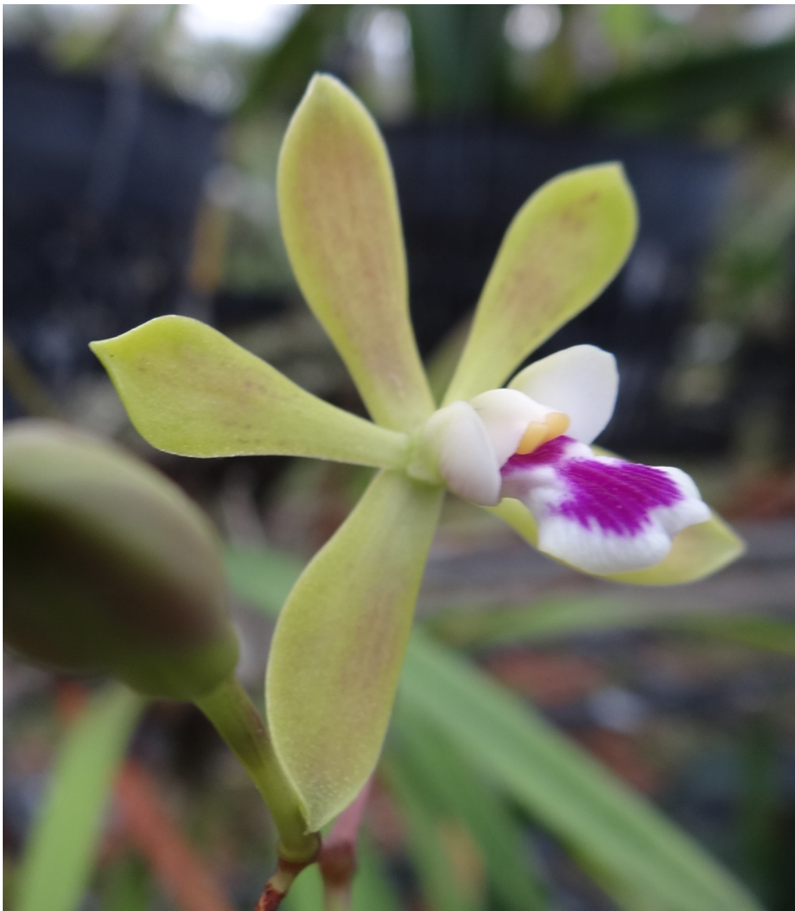
Encyclia androsiana Saulea