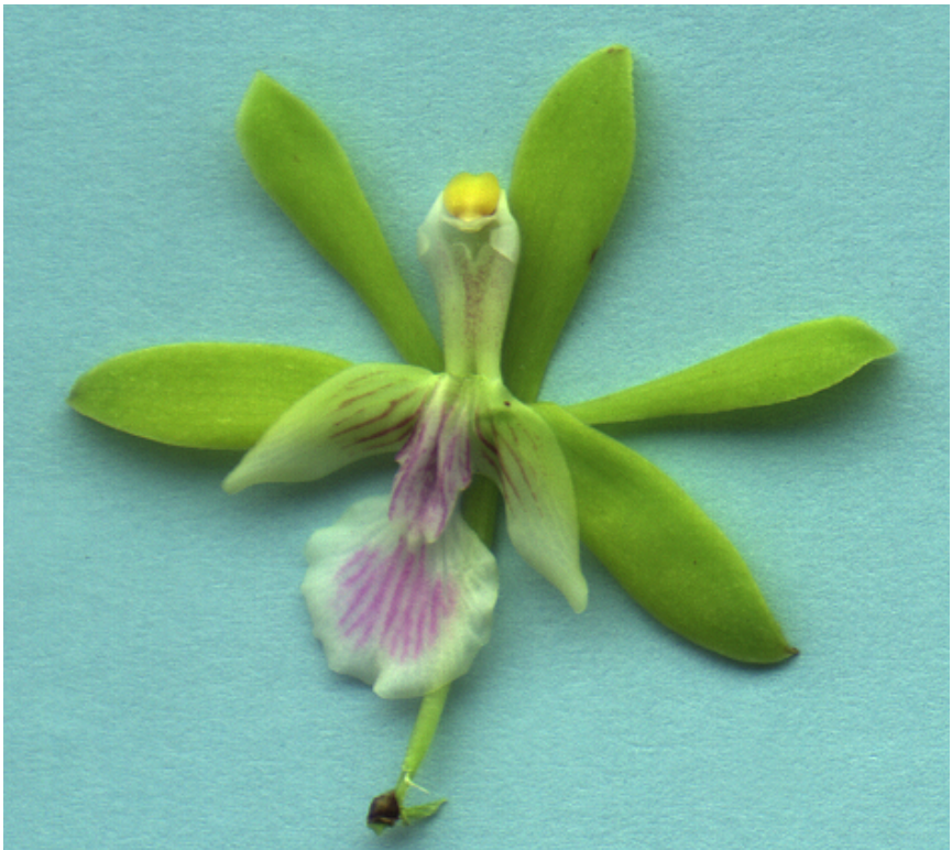
Encyclia tampensis (Lindl.) Small