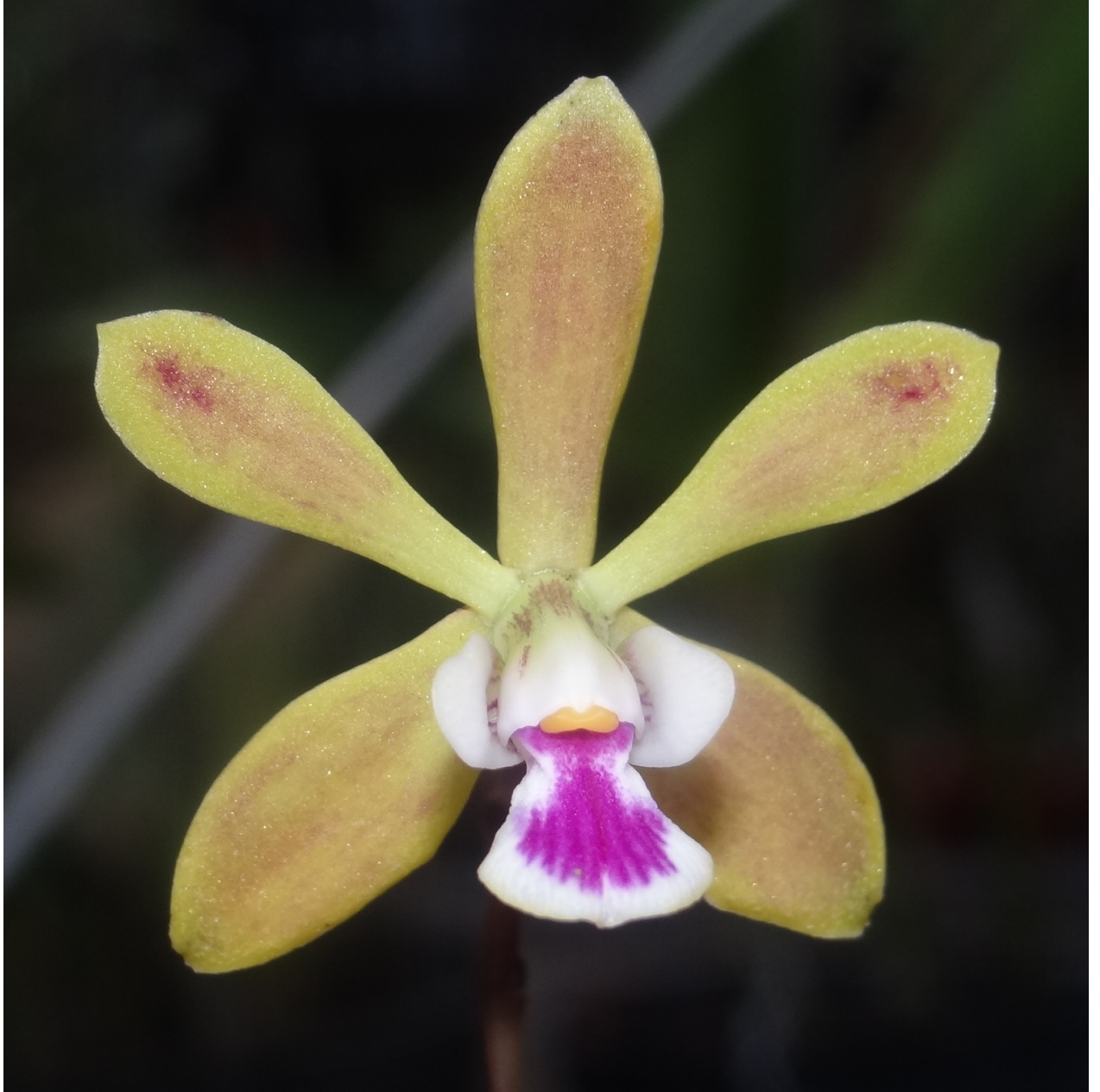
Encyclia androsiana Saulea