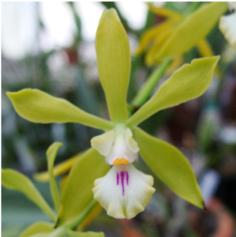
Encyclia feehlingii (Saulea) Saulea & Adams