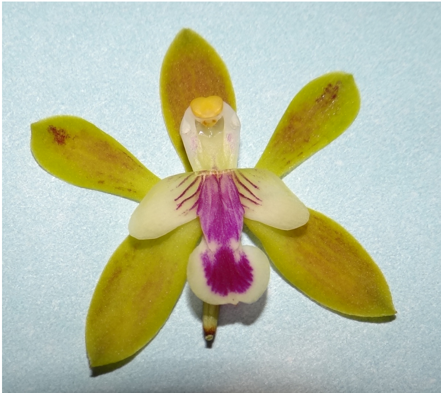
Encyclia androsiana Saulea