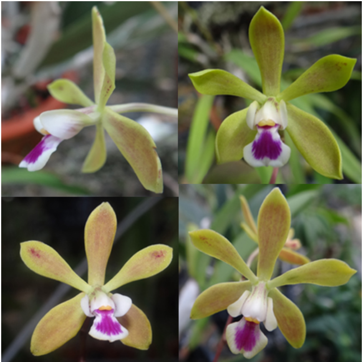
Variation in Encyclia androsiana Saulea