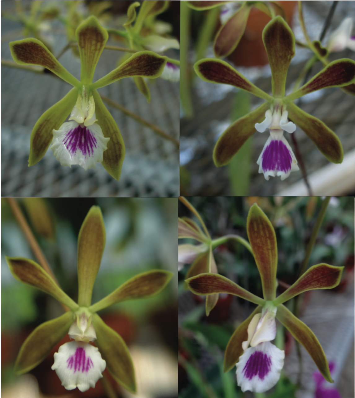
Variation in Encyclia tampensis (Lindl.) Small