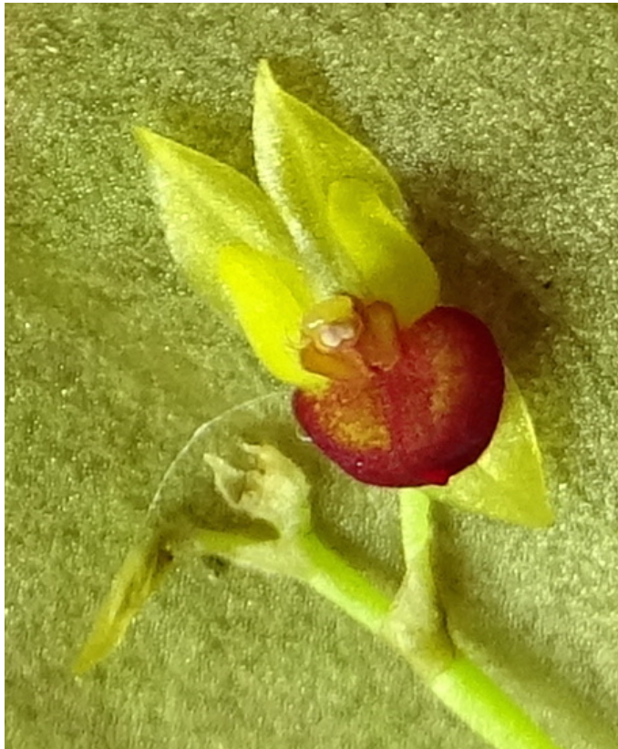
Lepanthes sanjuanensis Bogarín & Karremans. Additional plant from near Lago Calima with different coloration but with same overlap of upper portion of petals.