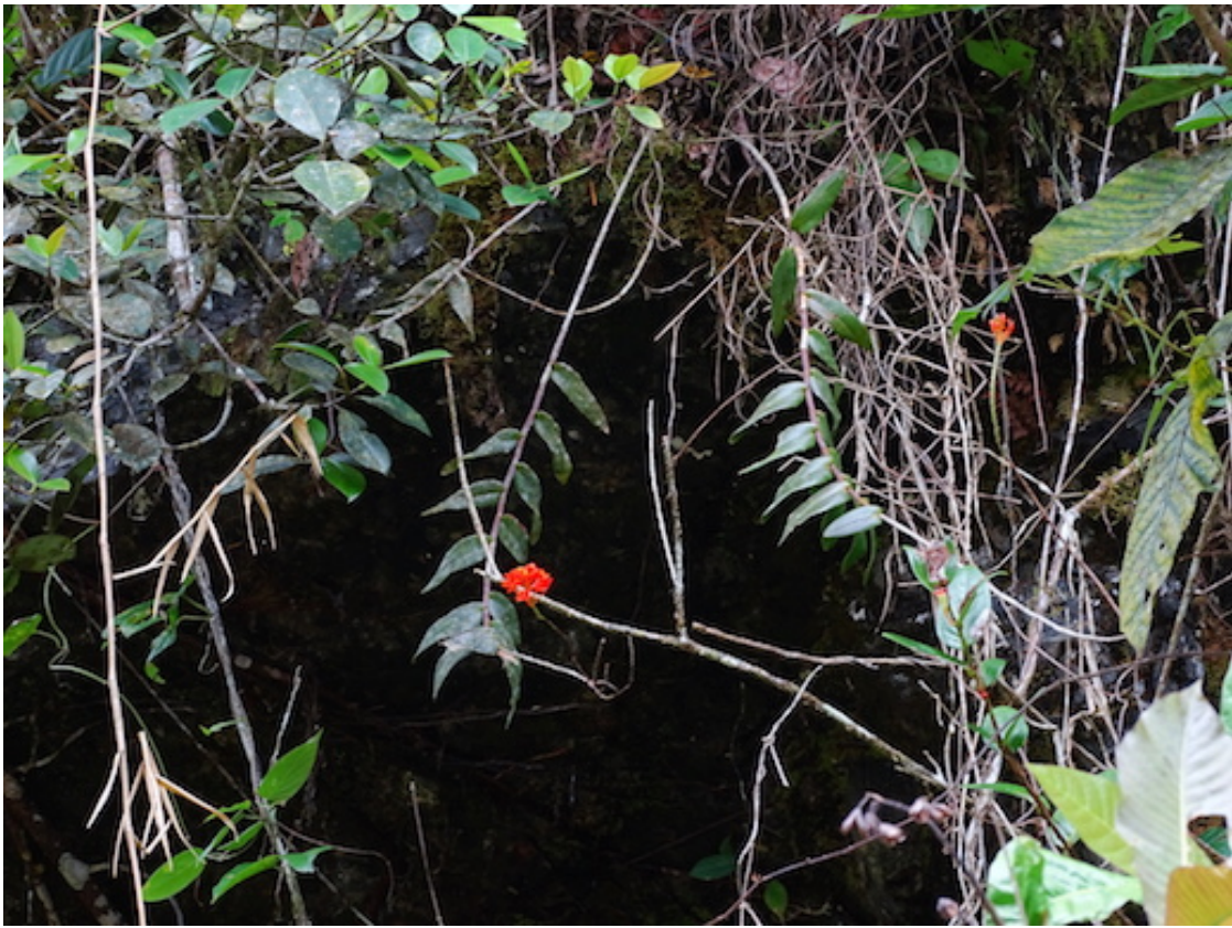
Epidendrum ramirez-santae Sauleda and Uribe-Velez in situ. Reserva Natural Municipal de Rio Bravo.