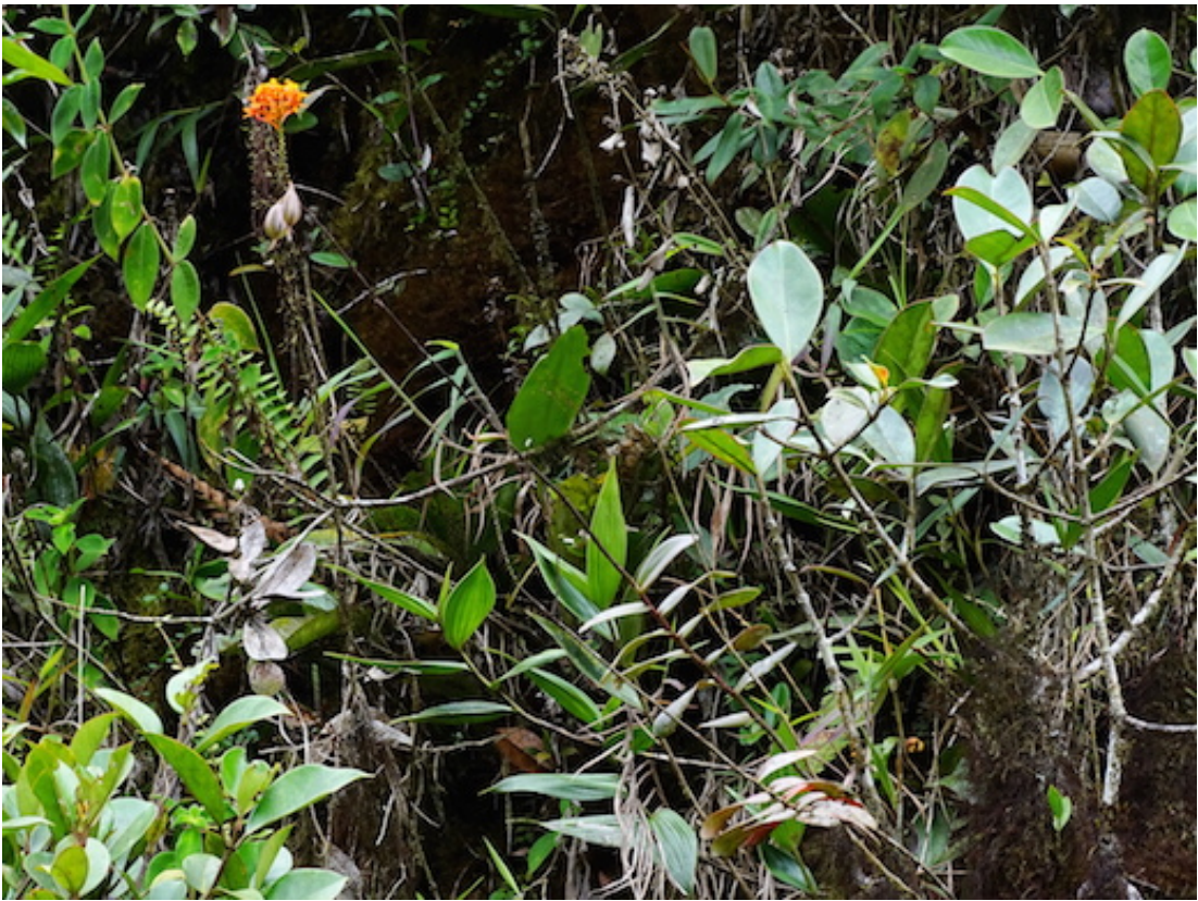
Epidendrum ramirez-santae Saulea and Uribe-Velez in situ. Reserva Natural Municipal de Rio Bravo.