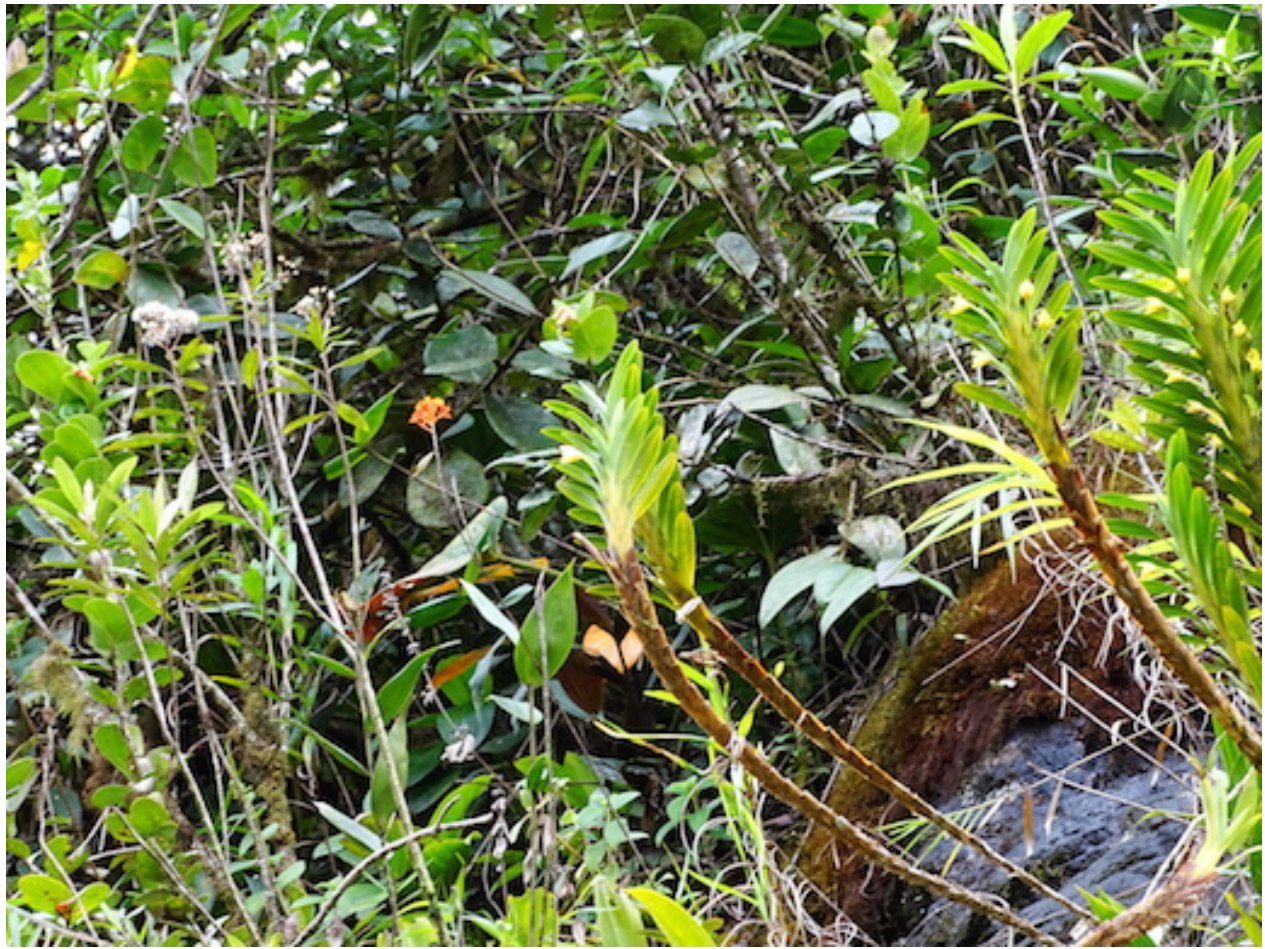
Epidendrum ramirez-santae Sauleda and Uribe-Velez in situ. Reserva Natural Municipal de Rio Bravo sympatric with Maxillaria sp.