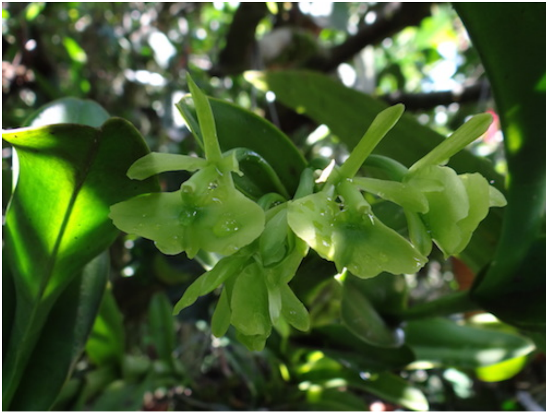
Epidendrum barbeyanum Kraenzl.