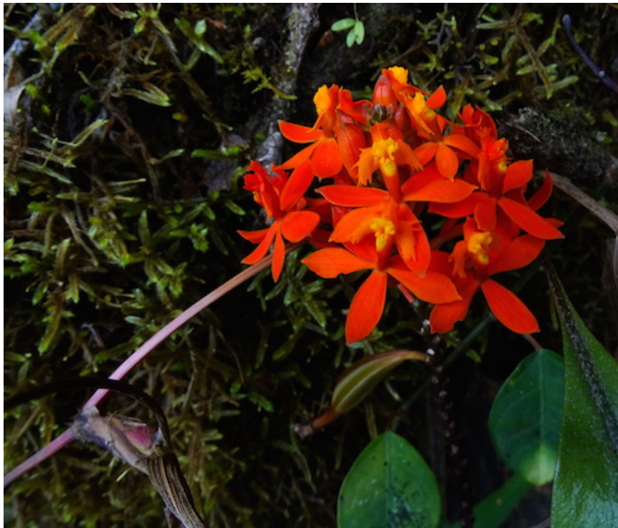
Epidendrum ramirez-santae Sauleda and Uribe-Velez in situ. Reserva Natural Municipal de Rio Bravo.