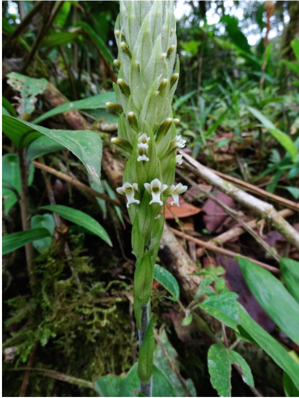
Erythrodes ovata (Lindl.) Ames.