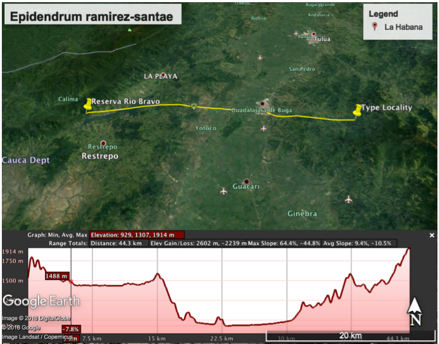
Localities for Epidendrum ramirez-santae Sauleda and Uribe-Velez.