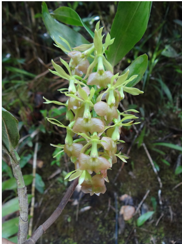
Epidendrum carchiense Hágsater & Dodson.