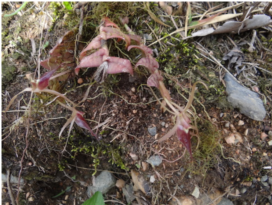
Epidendrum escobarianum Garay.