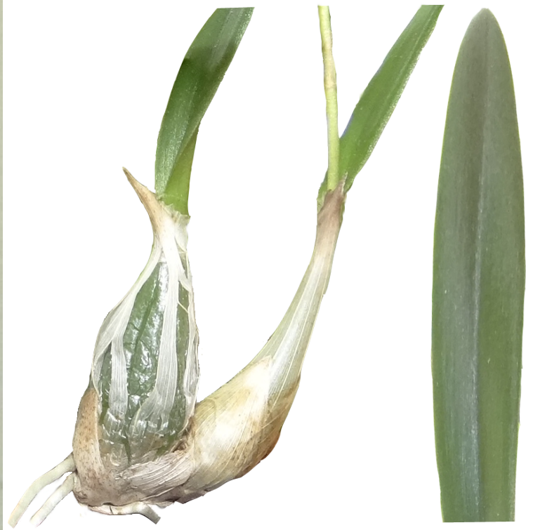
Encyclia triangulifera (Rchb. f.) Acuña